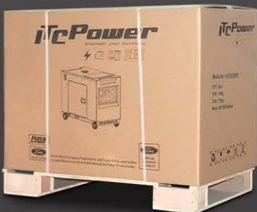
Individual pallet packing