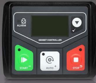
DC30 (ATS) Smart controller