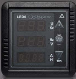
LED6 Voltage AC Power output Frequency Battery voltage Current Working time